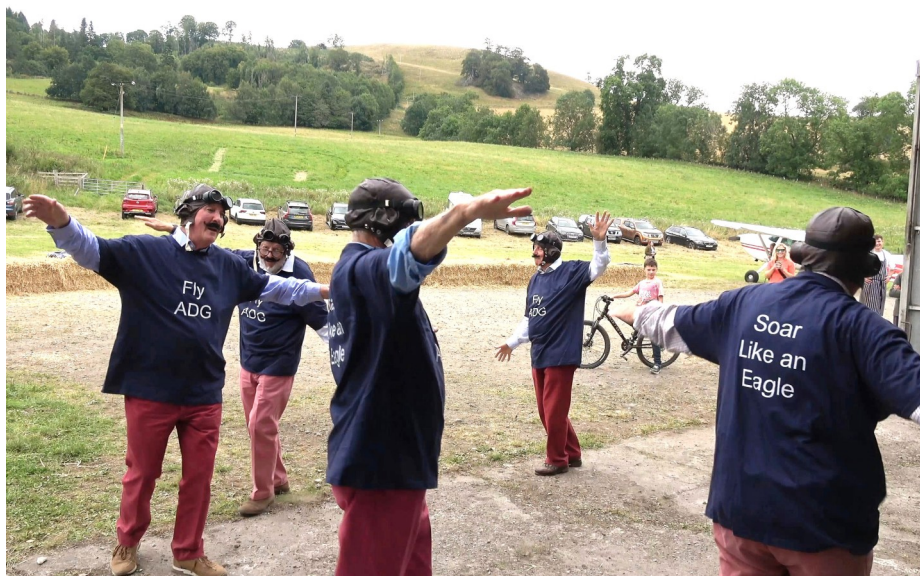
'Those Magnificent Men in their Flying Machines'