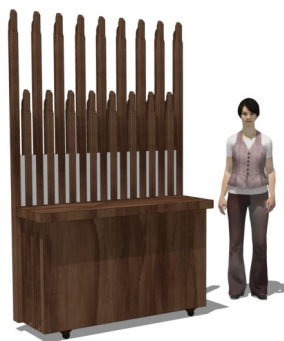
View from storage side