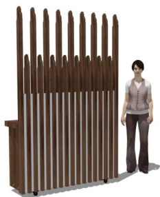
View from Screen side